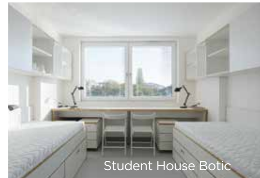
Student House Botic